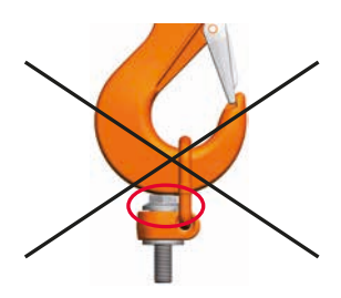
Picture 1: * Permissible range of application (ring must not touch the load)